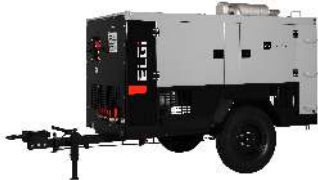
Diesel portable (Trolley) 185 - 1100 cfm / 100 - 300 psi