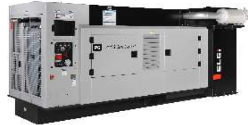
Diesel Portable (Skid) 500 - 1500 cfm / 150 - 400 psi