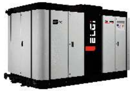
Oil-Free Series Screw 90 - 450 kW / 480 - 2515 cfm